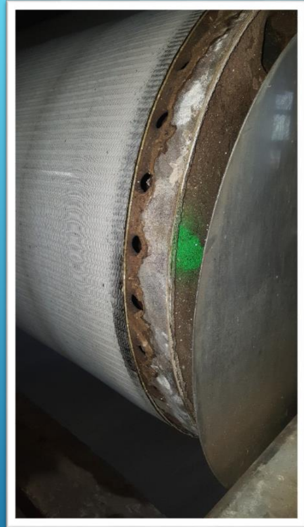
SIDE OF ROLLER JUNE 16, 2016