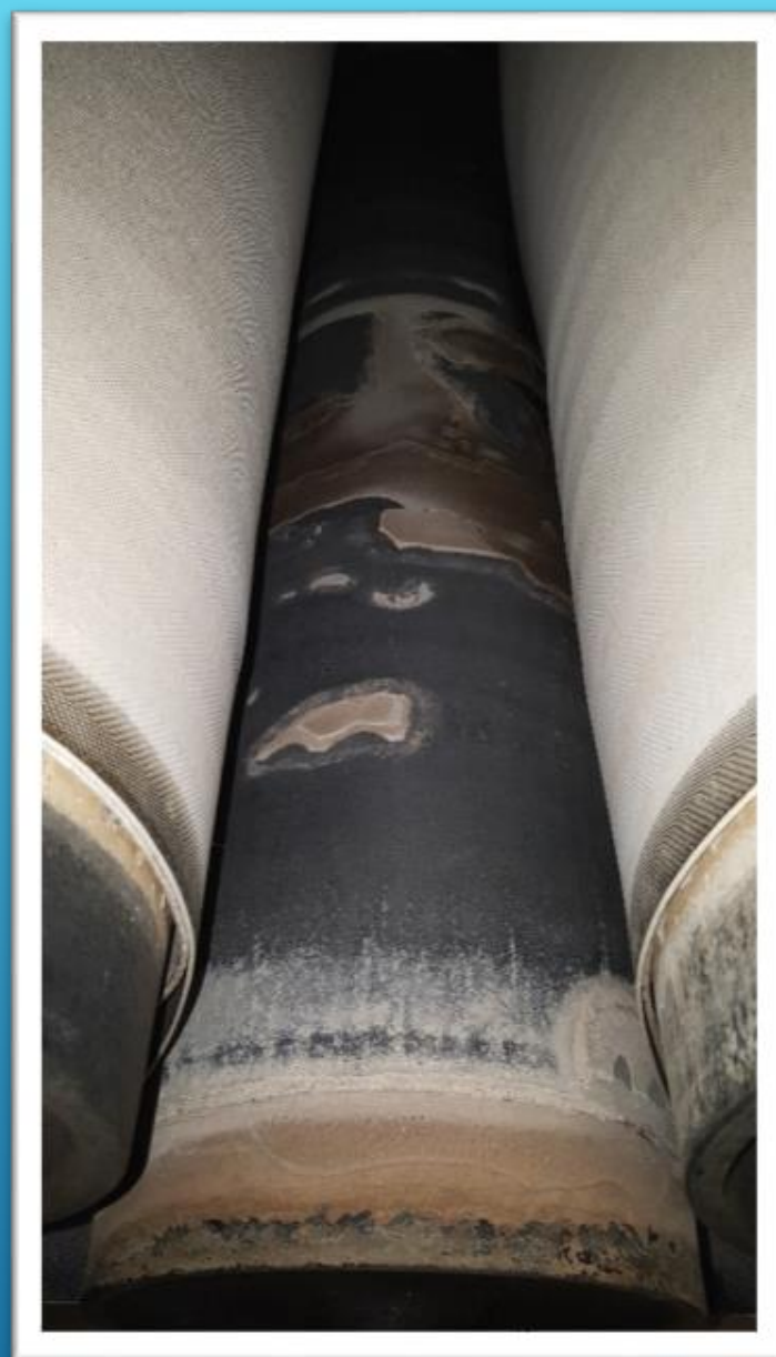
BOTTOM ROLLER JUNE 16, 2016