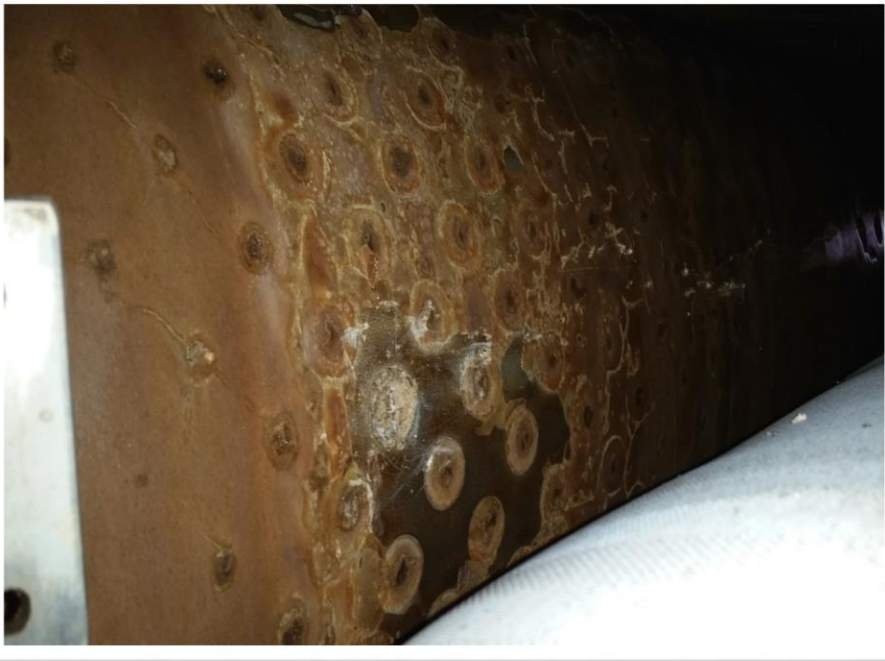
DRUM MAY 11, 2016