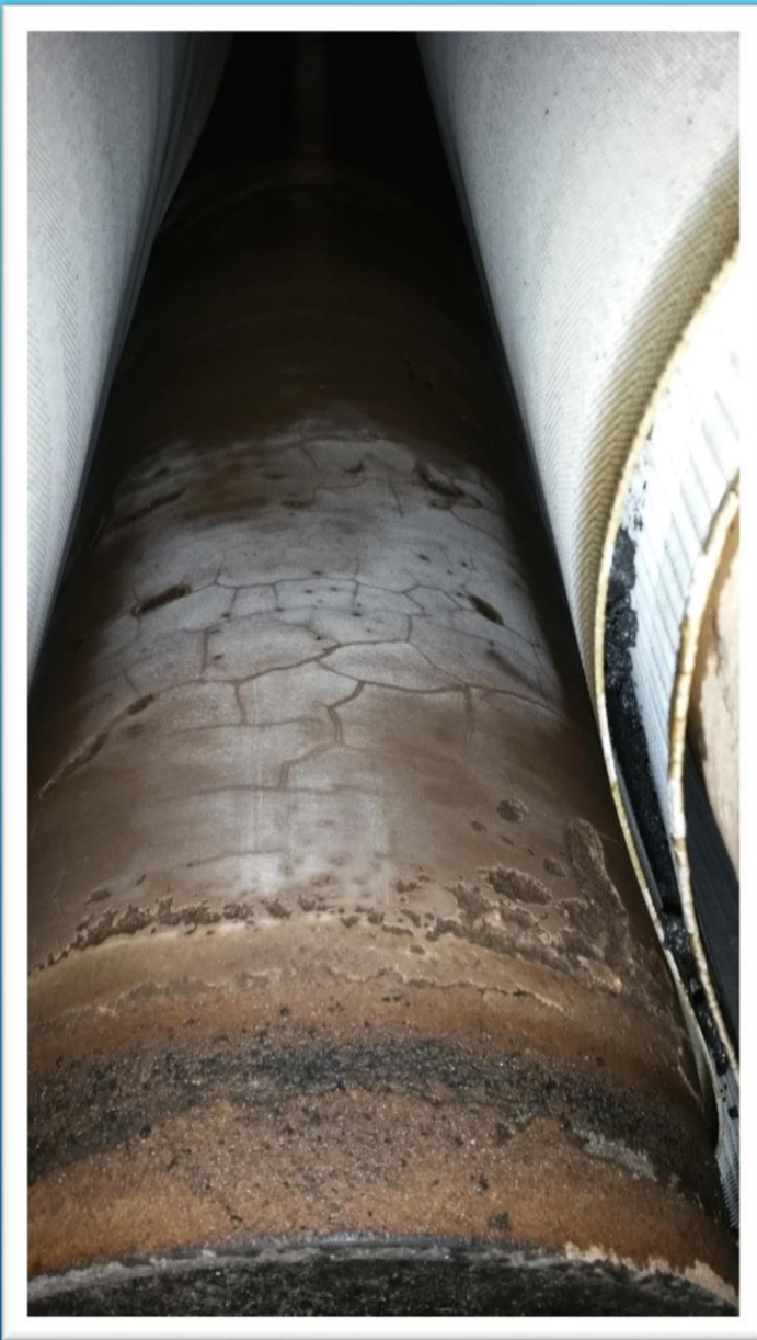
BOTTOM ROLLER MAY 11, 2016