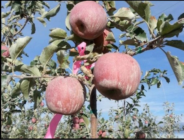
Without HydroFLOW - Hard scale accumulation which does not rub off