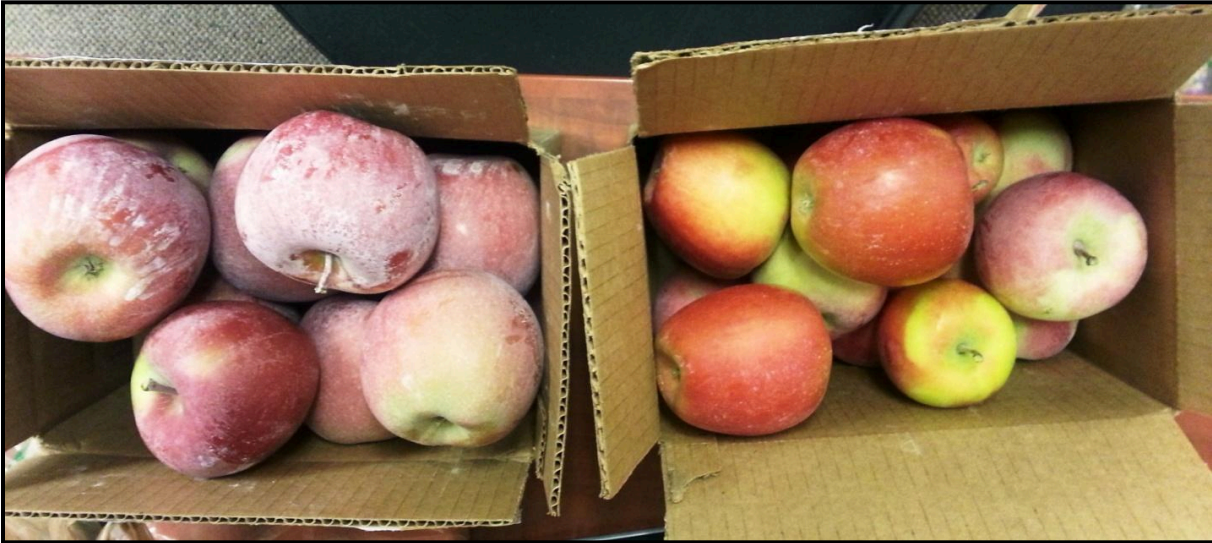
Apples from neighboring orchard