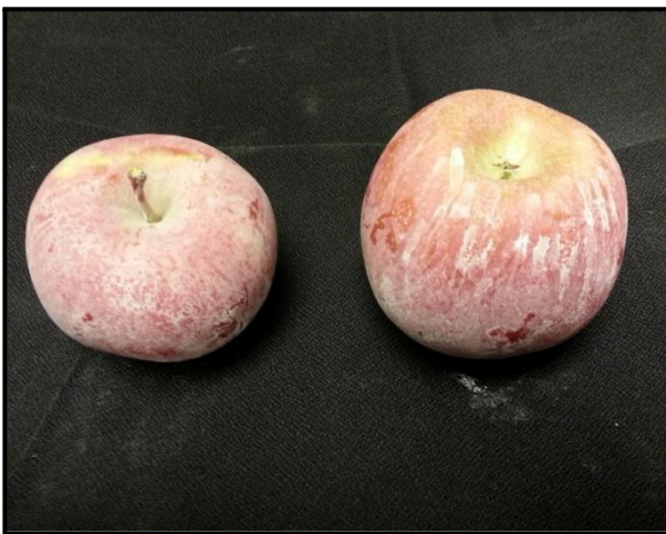
Apples from neighboring orchard