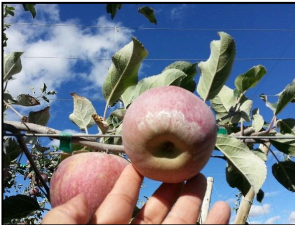
Apples from neighboring orchard (without HydroFLOW )