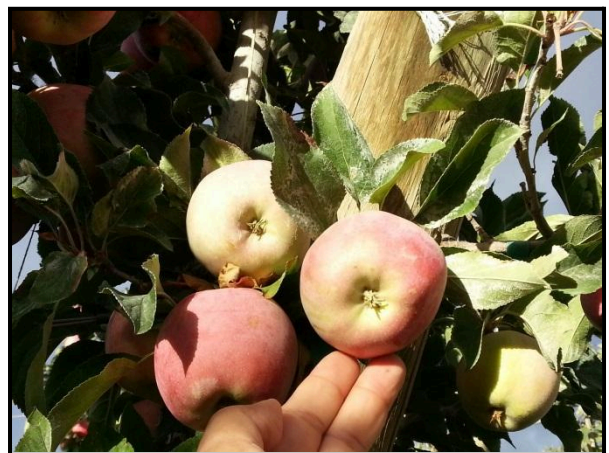
Apples from the treated orchard (with HydroFLOW )