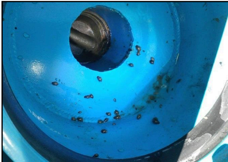
Snails in the filter before HydroFLOW