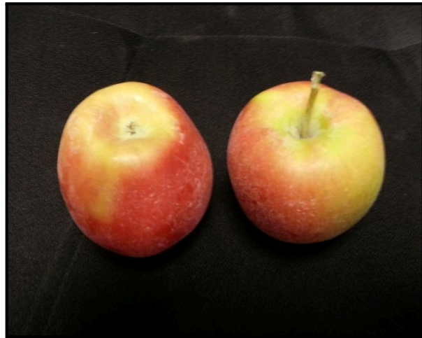
Apples from the treated orchard