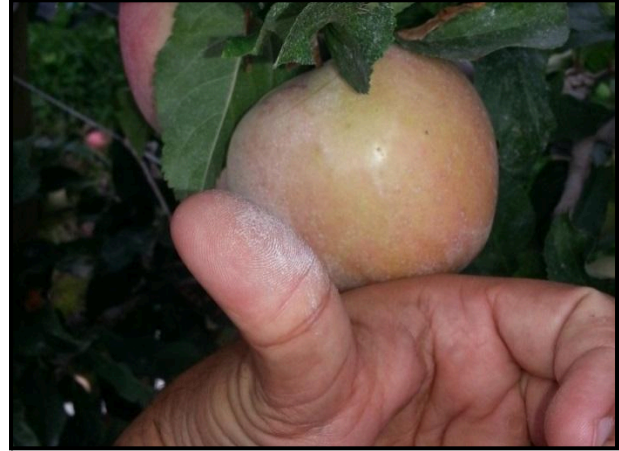
With HydroFLOW - Soft scale accumulation which easily rubs off